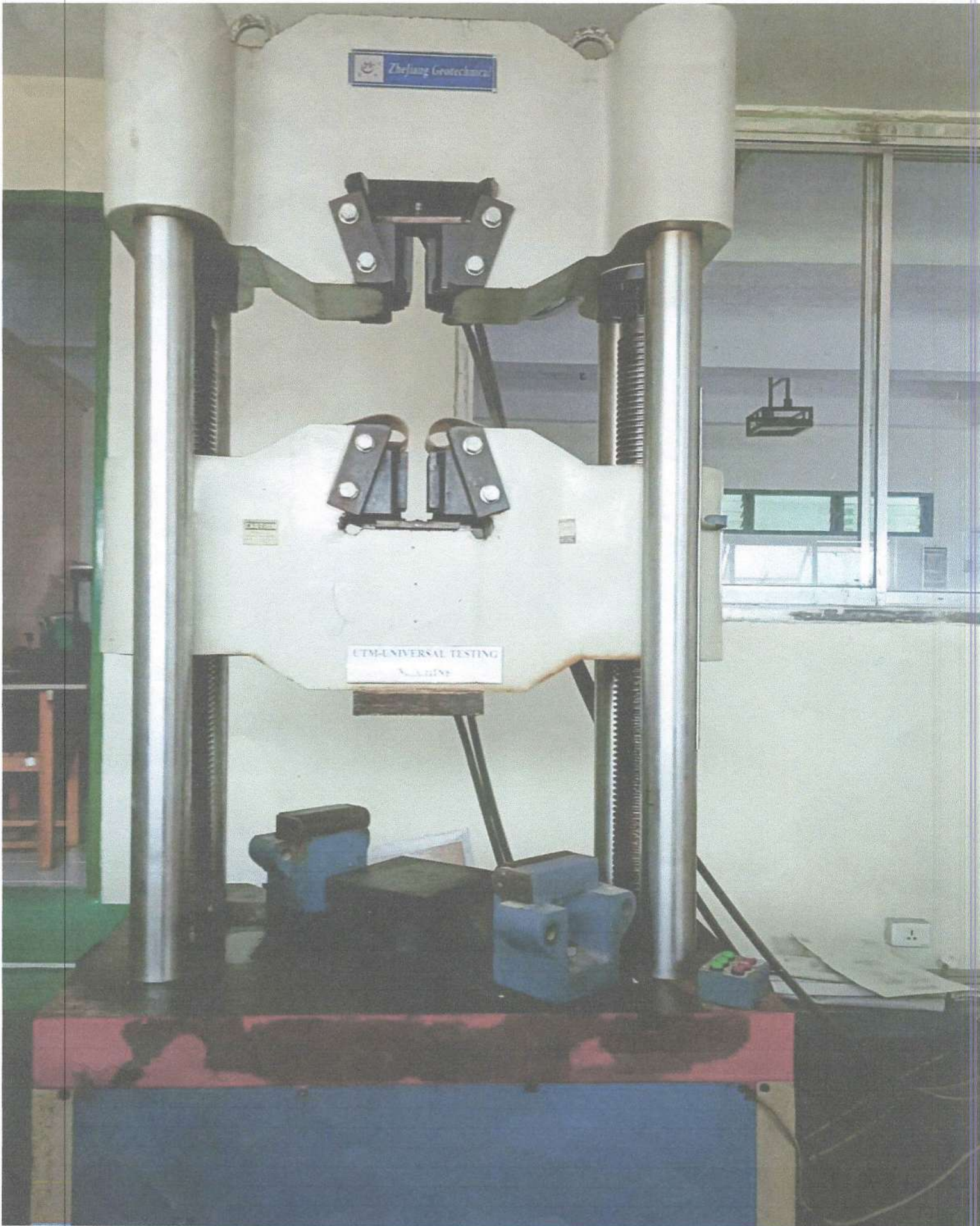
UTM For Calibration